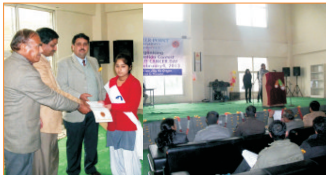
Declamation Competition on World Cancer Day

World Cancer Day is marked on February 4 to raise awareness of cancer and to encourage its prevention, detection, and treatment. 'World Cancer Day' was founded by the "Union for International Cancer Control (UICC)" to support the goals of the World Cancer Declaration and its aim is to significantly reduce death and illness caused due to cancer by 2020. CPUH had organized an awareness program on 'World Cancer Day' within the university campus. Students from various colleges and schools were invited to participate in the declamation competition held within university. The aim of such activity is to spread an awareness regarding cancer.