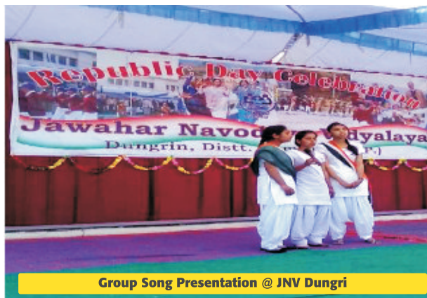
Group Song Presentation @ JNV Dungri