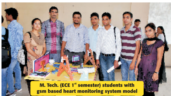
M. Tech. (ECE 1 st semester) students with gsm based heart monitoring system model