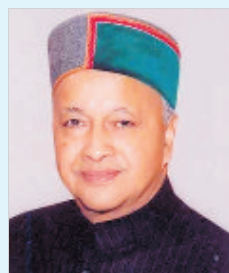
Virbhadra Singh Chief Minister Himachal Pradesh

It gives me immense pleasure to know that the Career Point University (CPUH) is publishing the second issue of its bi-annual university magazine titled-'Campus Chronicle'. I congratulate the university management, Teachers and students for this endeavour.