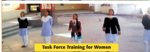
Task Force Training for Women