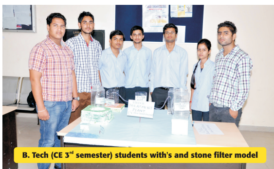
B. Tech (CE 3 rd semester) students with's and stone filter model