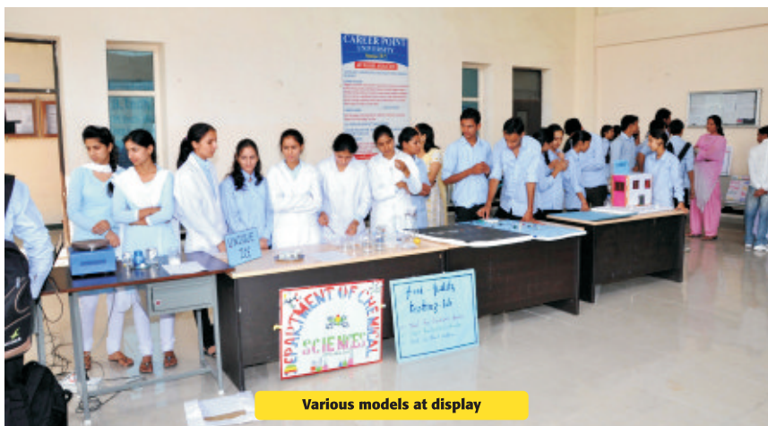
Various models at display