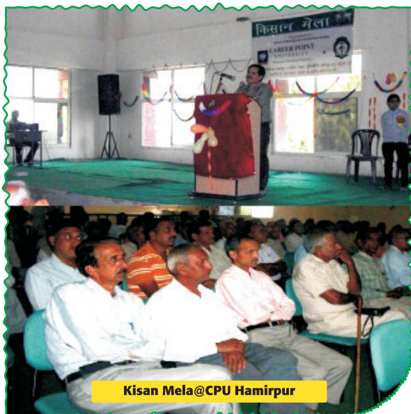
Kisan Mela@CPU Hamirpur

CPUH, in collaboration with CSK Agriculture University, Palampur, organized a 'Kisan Mela' within campus on 12th April, 2013. This program was organized by 'School of Management and Business Studies, CPUH'. The farmers were invited for this Mela through distributing pamphlets in newspapers and through personally conducting the phone calls. About 130 farmers from different places were present on the day.