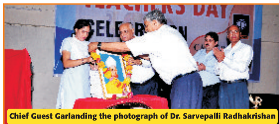
Chief Guest Garlanding the photograph of Dr. Sarvepalli Radhakrishnan