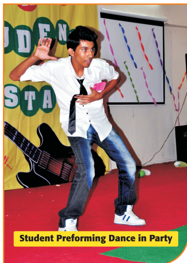
Student Performing Dance in Party