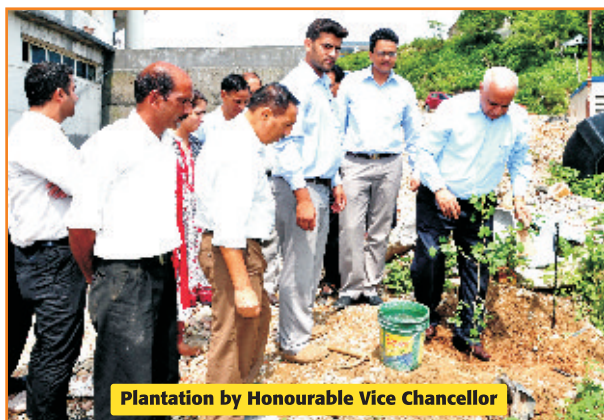
Plantation by Honourable Vice Chancellor