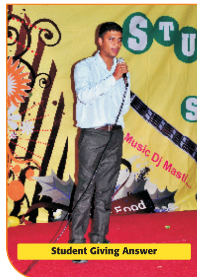
Student Giving Answer