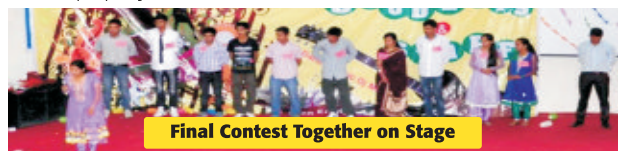
Final Contest Together on Stage