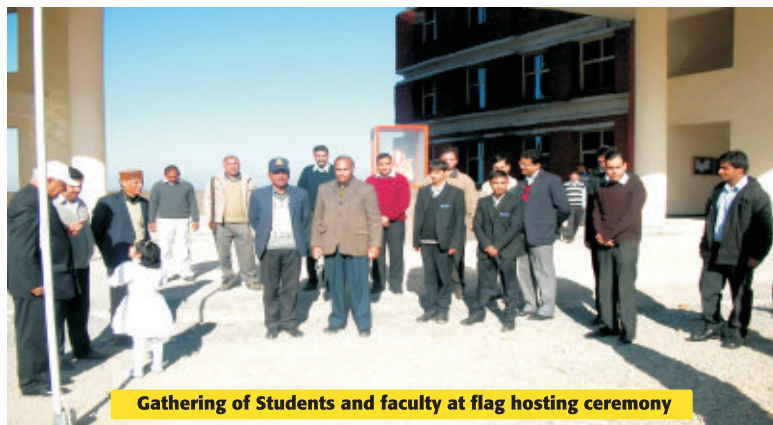
Gathering of Students and faculty at flag hosting ceremony