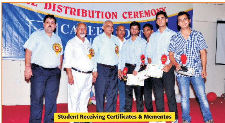
Student Receiving Certificates & Mementos